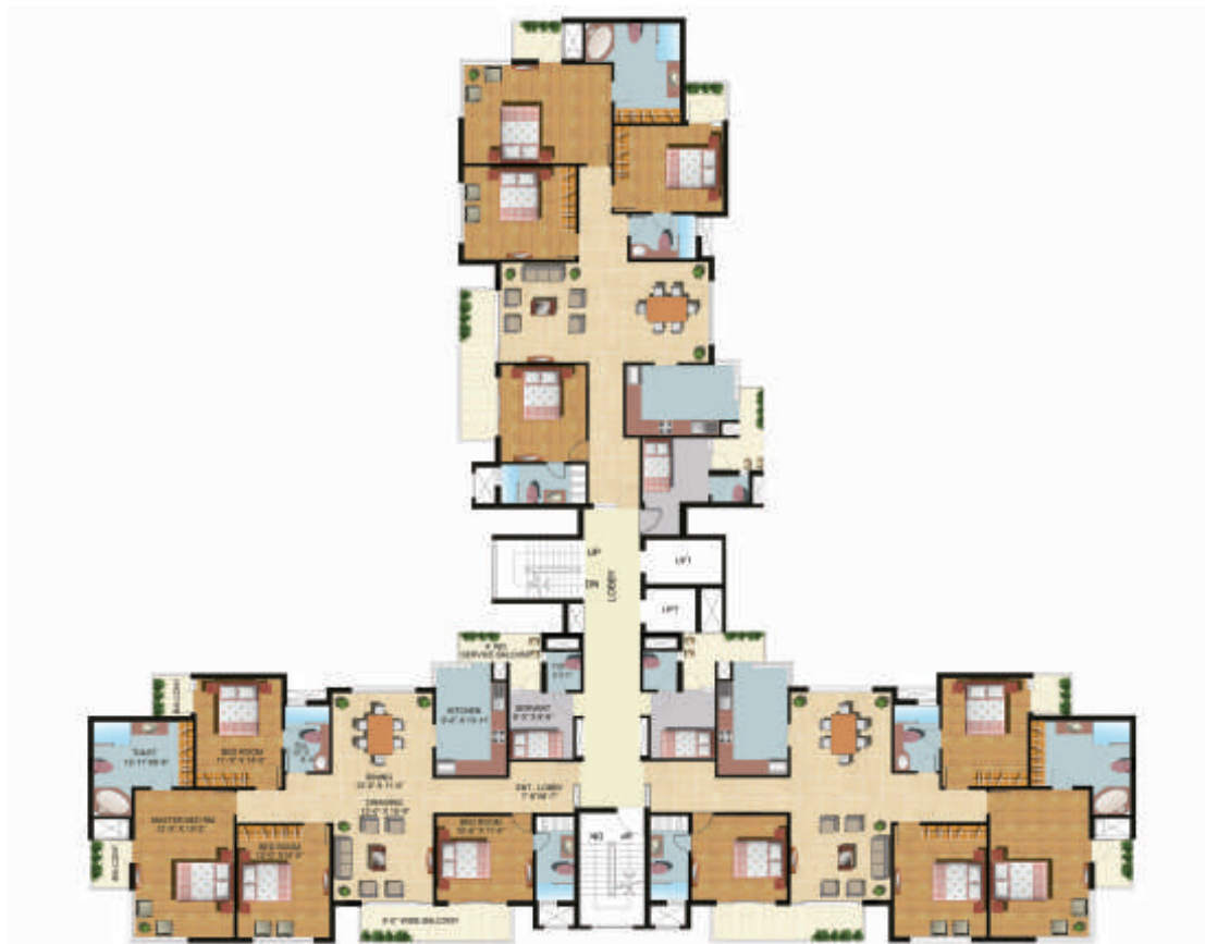
Typical Floor Cluster Plan Super Area = 2350 SQFT/UNIT

* THIS IS TENTATIVE PLAN SUBJECT TO APPROVAL FROM CONCERNED AUTHORITY