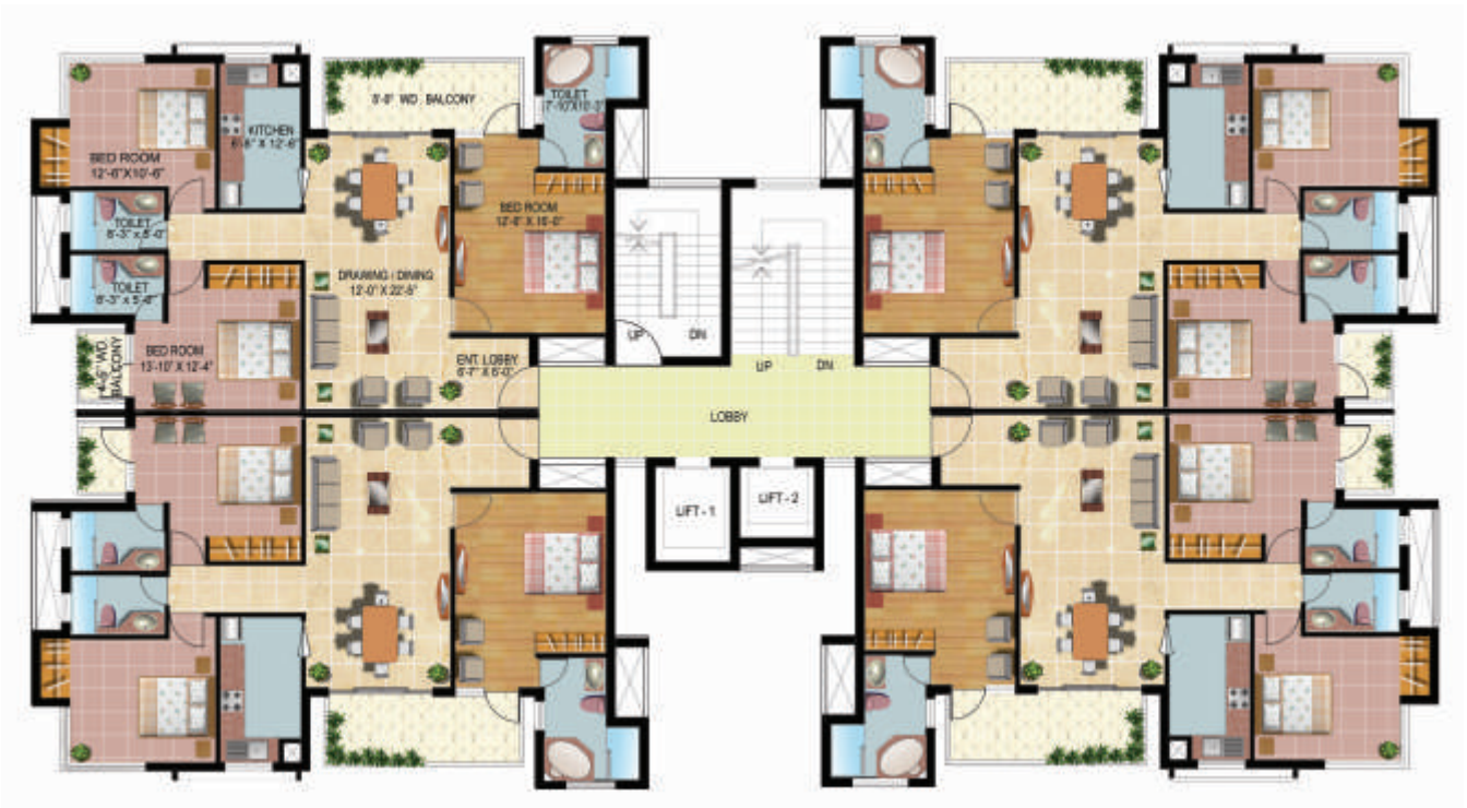
Typical Floor Cluster Plan Super Area = 1600 SQFT/UNIT

* THIS IS TENTATIVE PLAN SUBJECT TO APPROVAL FROM CONCERNED AUTHORITY