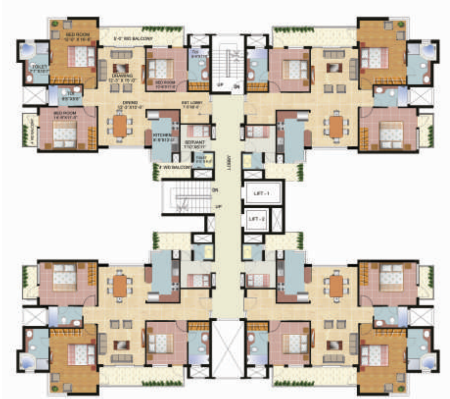
Typical Floor Cluster Plan Super Area = 1900 SQFT/UNIT

* THIS IS TENTATIVE PLAN SUBJECT TO APPROVAL FROM CONCERNED AUTHORITY