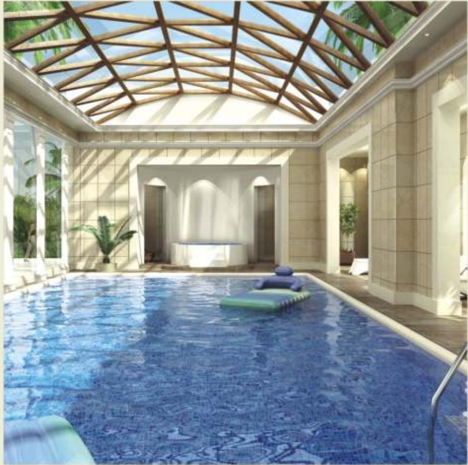
indoor climate controlled swimming pool