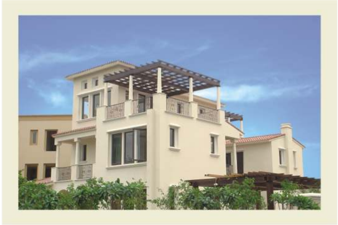
The Palm Springs, Gurgaon