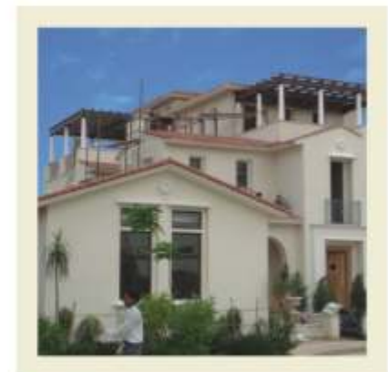
The Palm Springs, Gurgaon

Colliers International operates from over 257 offices in 57 Countries. With some of the most experienced and savvy project managers in the Country, Colliers will try to ensure that the project is built before schedule and with the highest quality of construction.